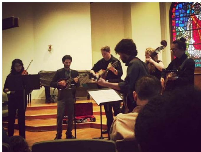
"Americana", the bluegrass ensemble at Concordia University Irvine, CA