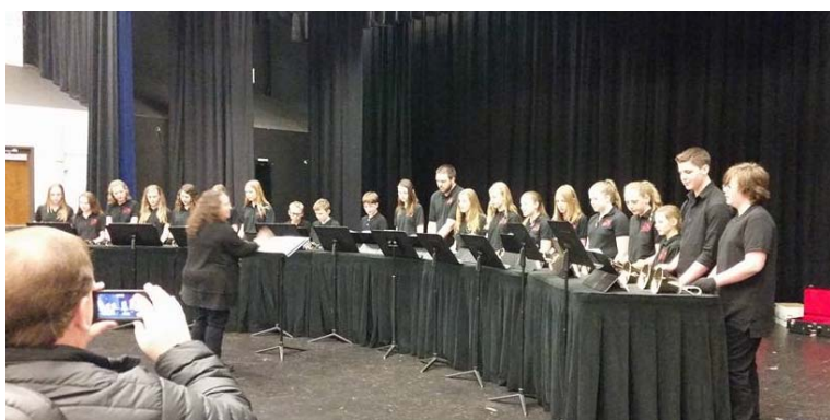
M.S. Handbell Ensemble at L.E.S.T.

We had a change in the elective structure this year which allowed for MANY more arts opportunities. All 6 th graders took World Music, all 7 th graders took Music Appreciation (European Music History) and the 8 th graders studied the History of Rock n' Roll.