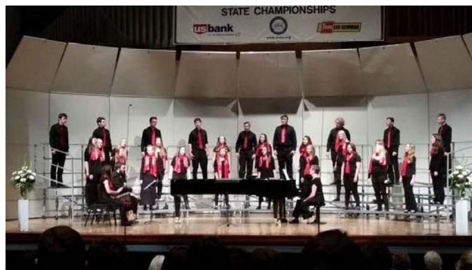
2016 OSAA State Choir Competition

What a busy year we had! Our students had a challenging year of music and drama, but far surpassed anyone's expectations and set new levels of musicianship and artistry in everything they did this year. Many of the HS Music and Arts events this year were either helping out around campus with different non-HS events or getting off campus into the community.